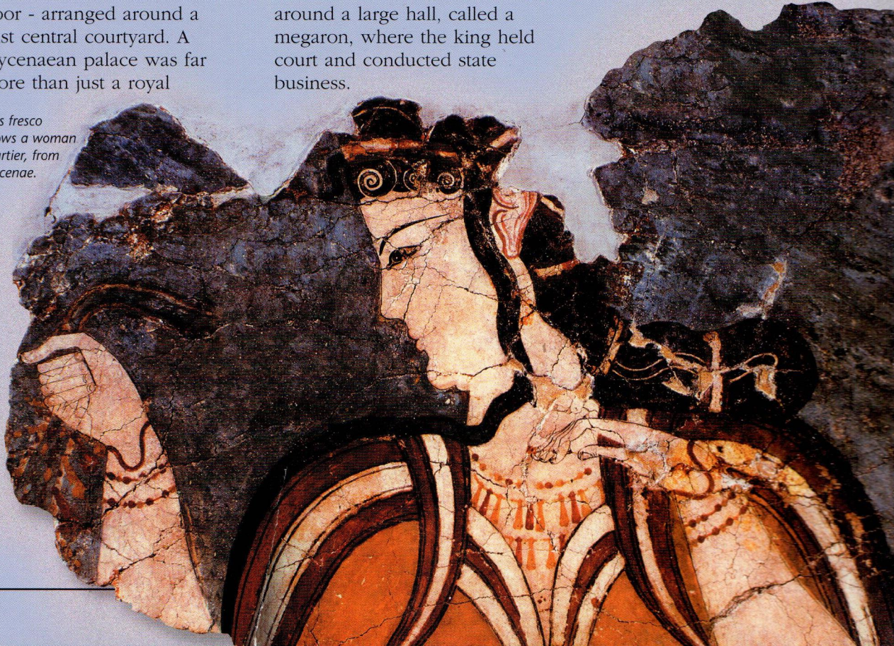
This fresco shows a woman courtier, from Mycenae.

residence. It was a military headquarters, an administrative base, and a workplace for craftsmen. Palace life revolved around a large hall, called a megaron, where the king held court and conducted state business.