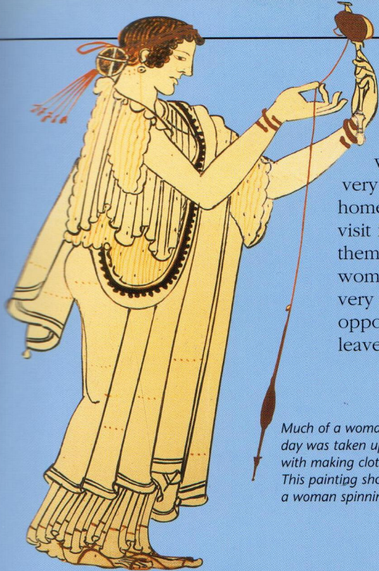
Much of a woman's day was taken up with making cloth. This painting shows a woman spinning.