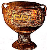
This Dark Age pot is painted with intricate geometric patterns.

From about 1000-700BC, during the Dark Ages, Greek pots were decorated with zigzag and geometric patterns. Later in this period, figures of animals and people began to be added to the designs, painted in between the bands of geometric decoration.