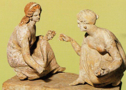
These pottery figures show two women playing a game called knuckle-bones.

Some people also enjoyed cruel sports, such as cat or dog fights. Games such as dice, or knuckle-bones, in which small animal bones were thrown like dice, were played at home or in special gaming houses.