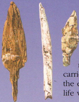
These Assyrian arrowheads were used to attack the city of Lachish.

The Hittites themselves came under attack from the Sea Peoples, around 1200BC. After this, the Assyrians began to regain power. By around 900BC, they had built up an efficient army, which they sent on raids, to demand payment from nearby countries.