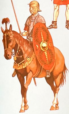
Cavalry soldier - A soldier who fought on horseback.

Legionary - A foot soldier. Only Roman citizens could be legionaries.