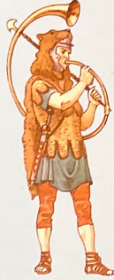
Cornicen - A horn-blower who sent signals during battles.

Auxiliary - A non-citizen who fought in the army. Each legion had its own groups of auxiliaries.